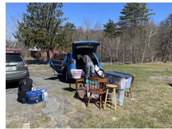
Assessing the packing situation.