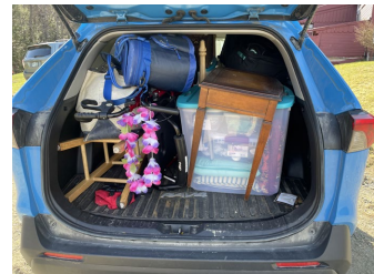
The Tetris Fest to get all the costumes and set pieces to the next theater.