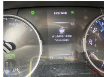
It is a little unsettling when the car asks me if I need a break.