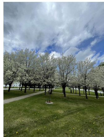
The stunning beauty of Southern Vermont Arts Center.