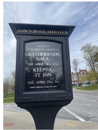
Town Hall Theater - Middlebury, VT