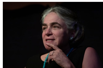
Big Nance in the 1960s

Photos from KEEPING IT INN Pierce's Inn October 20, 2022