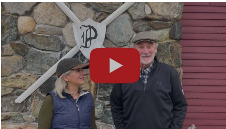
Keeping It Inn : Family Members' Reactions

Interviews with Pierce family members about KEEPING IT INN .