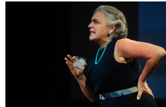
Big Nance in the 1960s

Photos from KEEPING IT INN Briggs Opera House January 20, 2023