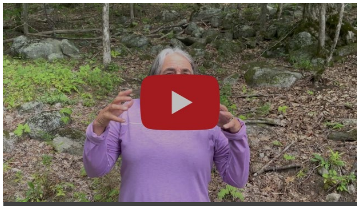
Sex Drive Part 1

Below you can watch the first two videos in a series about Sex Drive. You can read more about what inspired this topic below the second video.